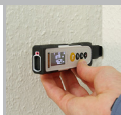
Pin for measurements out of a corner