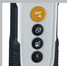
Multi purpose functions